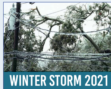
WINTER STORM 2021

These notifications allowed the citizens to prepare ahead of time by getting their property secured as much as possible before the storms hit, which lessened the damages